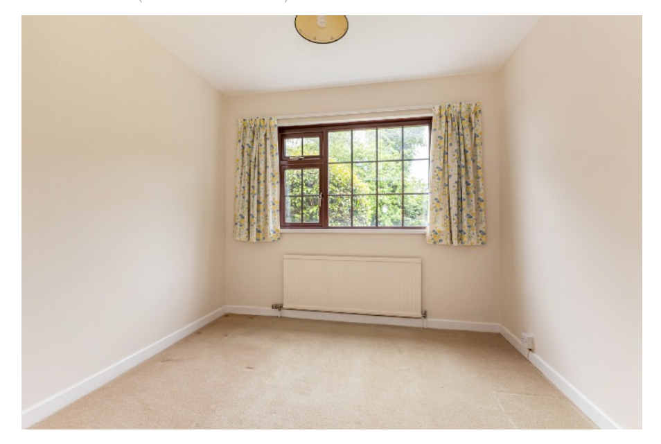
BEDROOM (4): 12' 0" x 10' 1" (3.66m x 3.07m) Currently used as lounge.