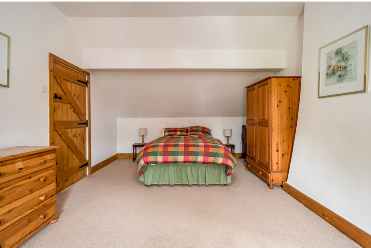
BEDROOM (6): 17' 10" x 12' 7" (5.43m x 3.83m) (at widest points) Twin aspect.