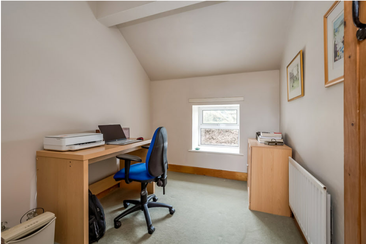
BEDROOM (5): 18' 0" x 12' 5" (5.49m x 3.78m) Door to second landing (with additional staircase down to living room). Storage cupboard.