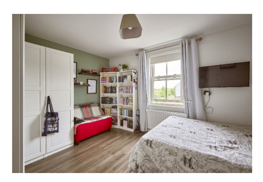
BEDROOM (4): 11' 8" x 9' 10" (3.56m x 3m) Plus range of built in furniture including robes, cupboards and shelving. Access to eaves storage.

BEDROOM (3): 13' 7" \times 11' 8" (4.14m x 3.56m) Including range of build in furniture including robes, cupboards, shelving and dressing table unit. Access to eaves storage.