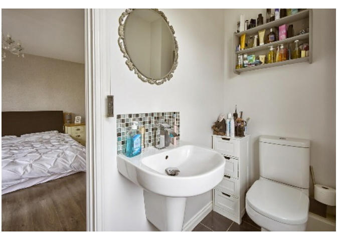
ENSUITE SHOWER ROOM: White suite comprising wash hand basin with mixer tap and tiled splash back, low flush wc, large fully tiled shower cubicle, tiled floor, down lighting, extractor fan. BEDROOM (2): 13' 10'' \times 10' 8'' (4.22m \times 3.25m)