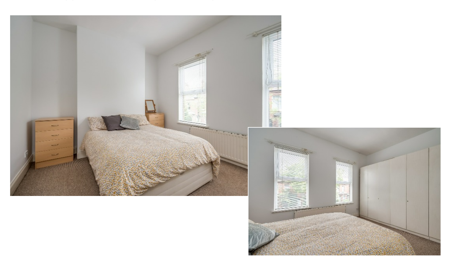
BEDROOM (2): 11' 2" \times 8' 5" (3.4m \times 2.57m) Hatch to roofspace.