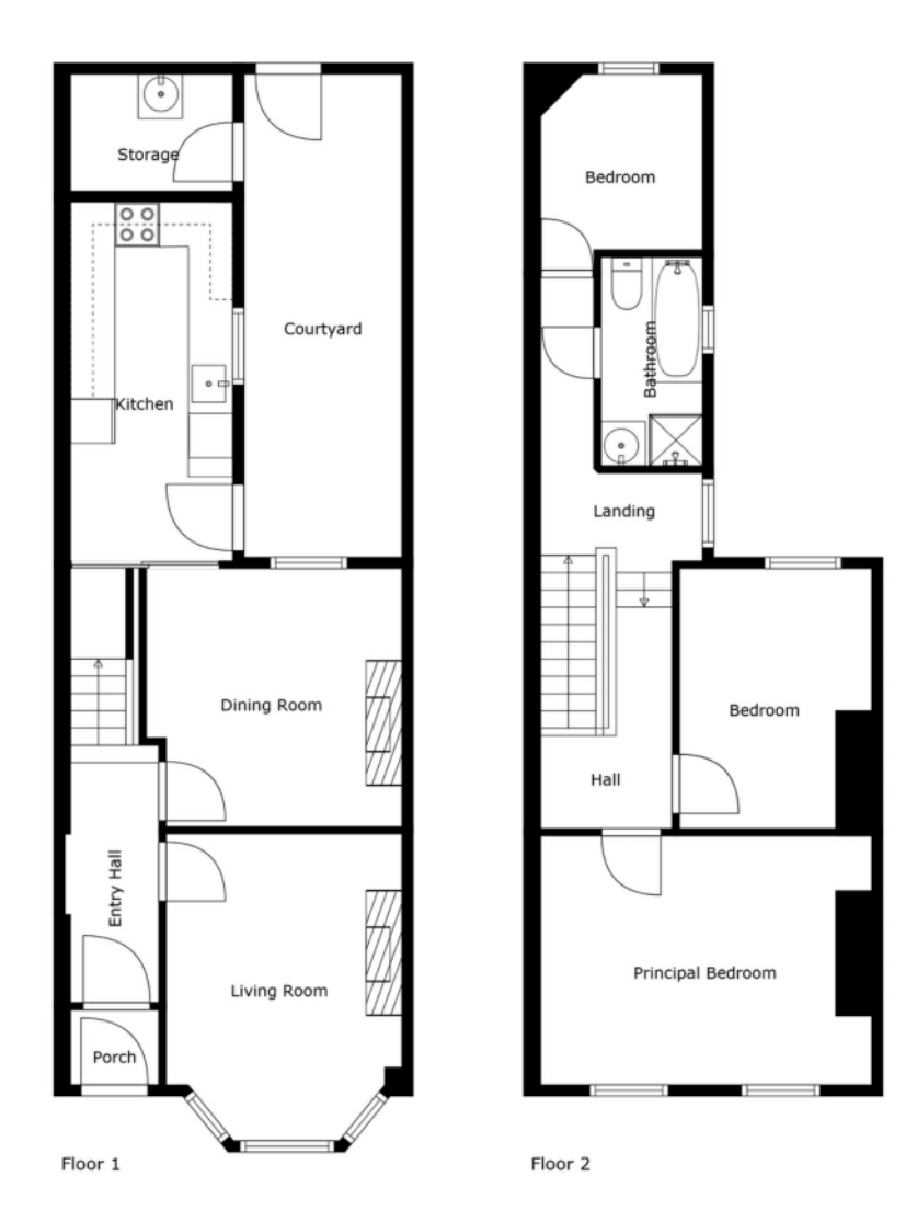
Sizes And Dimensions Are Approximate. Actual May Vary.