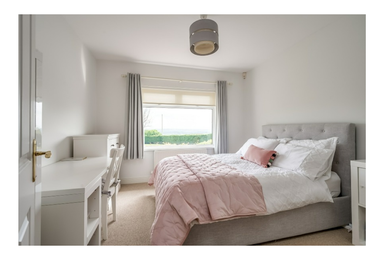
BEDROOM (4): 10' 9" \times 10' 7" (3.28m \times 3.23m) Range of built-in robes.

BEDROOM (3): 13' 5" \times 9' 11" (4.09m \times 3.02m) Built-in wardrobe.