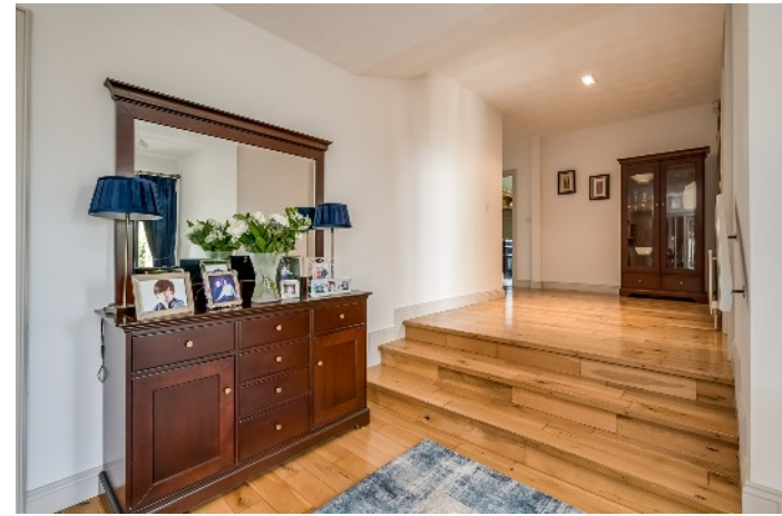
FAMILY ROOM: 19 ^{\circ} 10 ^{\circ} x 13 ^{\circ} 7 ^{\circ} (6.05m x 4.14m) Matching solid oak wooden floor, reading nook, views across the countryside.